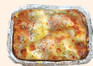
Roast Veg Lasagne For 2 $10 For 4 $18