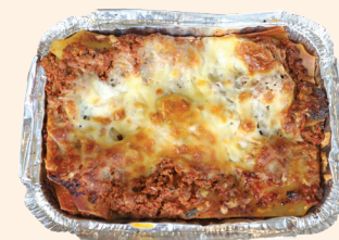
Angus Beef Lasagne For 2 $10 For 4 $18