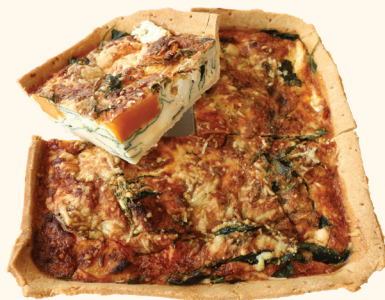
Pumpkin, Feta, Spinach $18