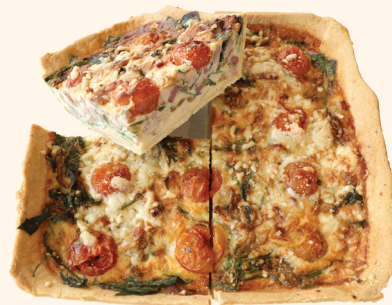
Bacon, Tomato, Cheese, Spinach $20