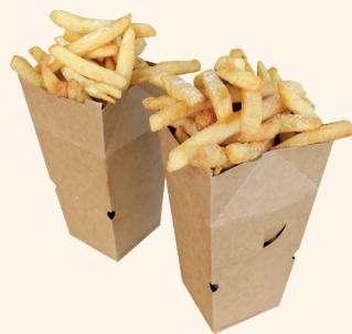
Hot Chippies large box $8