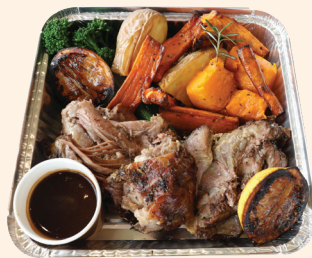
Roast Lamb Meal For 2 $32

Slow cooked Roast Lamb shoulder with garlic and rosemary served with a medley of roast veggies, potato, sweet potato, pumpkin, carrots, broccoli and a little pot of jus