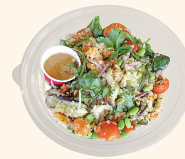
Roast Veggie Quinoa Salad $14

rice noodles, carrot, capsicum, cucumber, mixed greens, crispy shallots, garlic ginger soy dressing - with your choice of prawns or beef