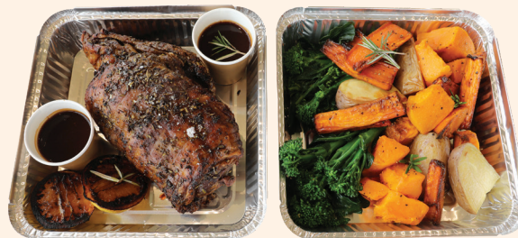
For 4 $58