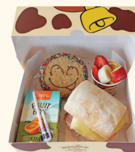
Kids lunchbox $9 ham & cheese baguette, giant choc chip cookie, fresh fruit cup, juice box