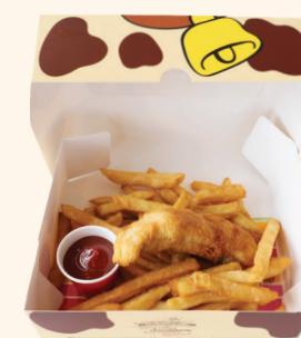
Kids lunchbox $11 market fresh battered fish, golden chips, tomato sauce