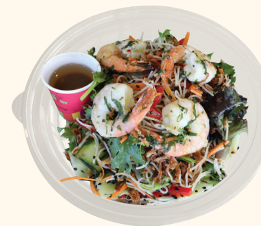
Thai Noodle $16

rice noodles, carrot, capsicum, cucumber, mixed greens, crispy shallots, garlic ginger soy dressing - with your choice of prawns or beef