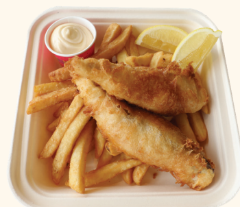
Fish & Chips $14 market fresh battered fish, golden chips, aioli, lemon