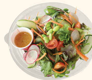
Autumn Garden Salad Large $12

pumpkin, zucchini, eggplant, rocket, edamame beans, red onion, toasted pumpkin, pepitas with citrus orange dressing