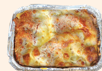
Roast Veg Lasagne For 2 $10 For 4 $18