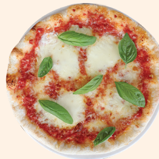
Margherita $14 tomato base, fresh mozzarella, fresh basil (V)