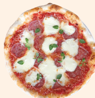
Pepperoni $15.5 tomato base, fresh mozzarella, parmesan, fresh oregano