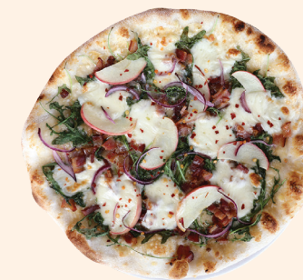
Smokehouse bacon $16 confit garlic base, fresh mozzarella, red onion, chilli flakes, rocket, apple