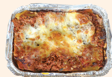
Angus Beef Lasagne For 2 $10 For 4 $18