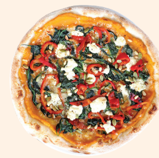
Pumpkin $15 roasted pumpkin base, Yarra Valley feta, spinach, fire roasted capsicum (V) ADD $3 maple smoked bacon or chicken