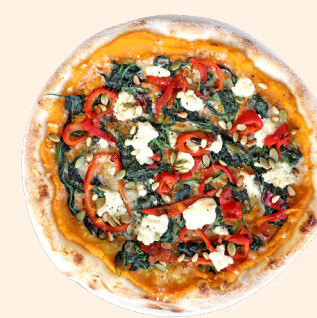
Pumpkin $15 roasted pumpkin base, Yarra Valley feta, spinach, fire roasted capsicum (V) ADD $3 maple smoked bacon or chicken