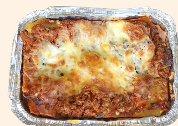
Angus Beef Lasagne For 2 $10 For 4 $18